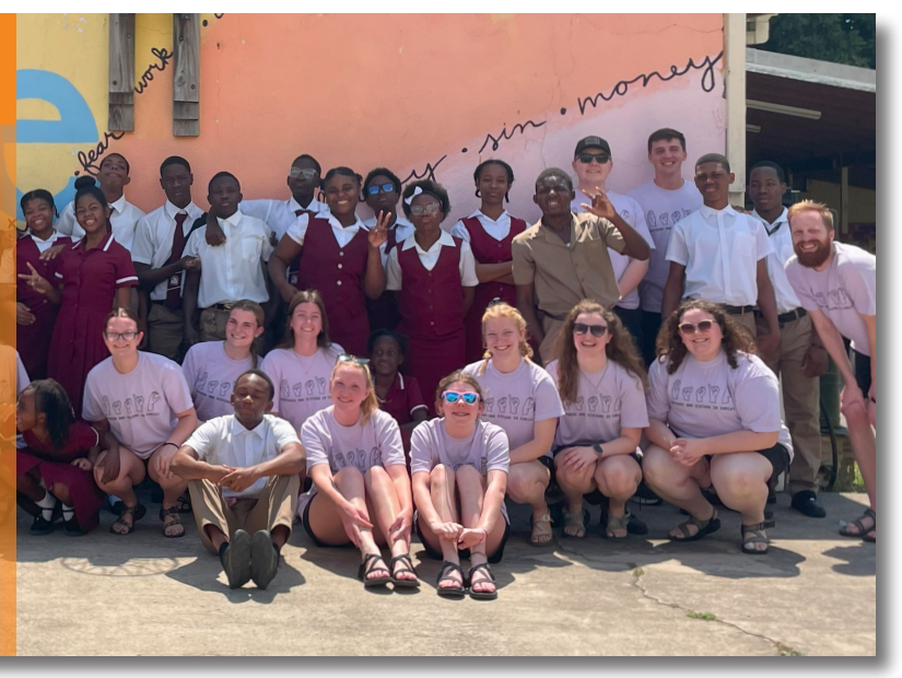
BASIC Jamaica Mission Trip

Recordings of sermons available on Vimeo.com/mynazareth Livestreams Broadcast on our website www.naz.org/onlinechurch