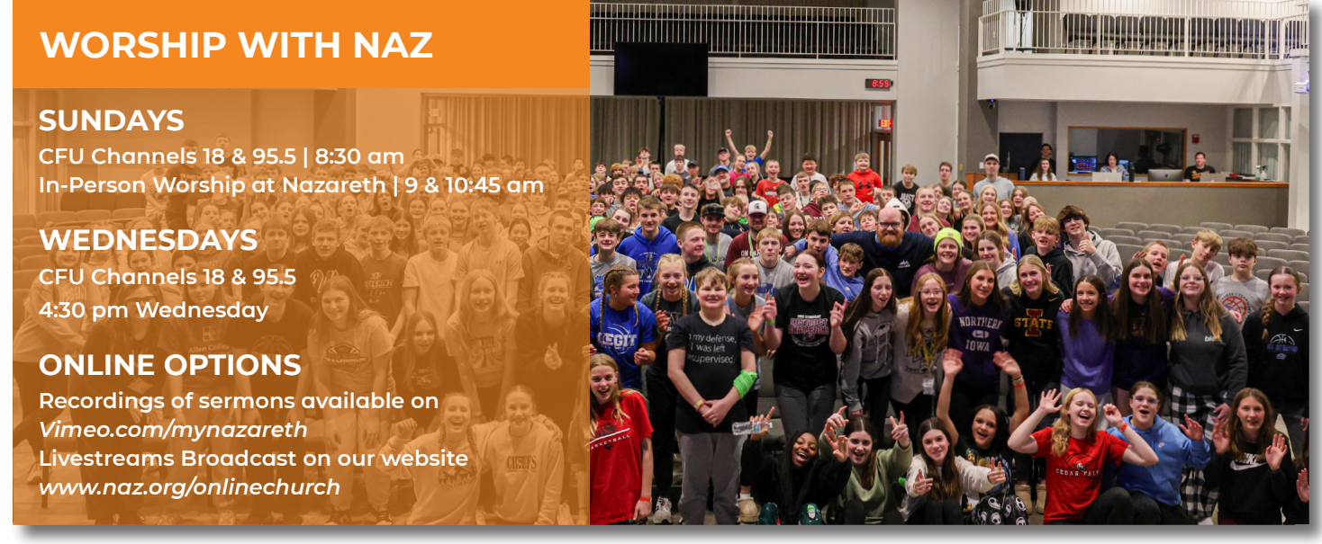
CHAOS Ski & Shop Trip