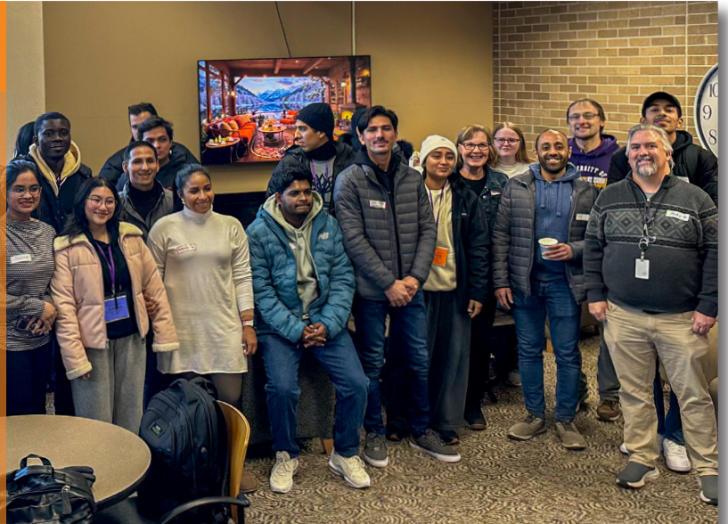
Cocoa and Coats Event

Recordings of sermons available on Vimeo.com/mynazareth Livestreams Broadcast on our website www.naz.org/onlinechurch