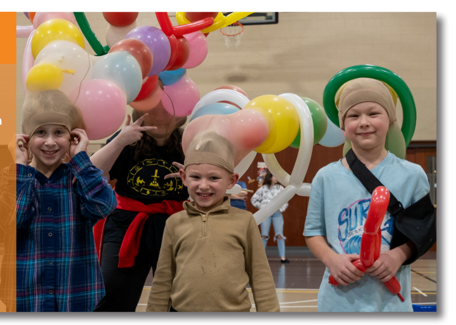
Family Christmas Extravaganza 2024

Recordings of sermons available on Vimeo.com/mynazareth Livestreams Broadcast on our website www.naz.org/onlinechurch