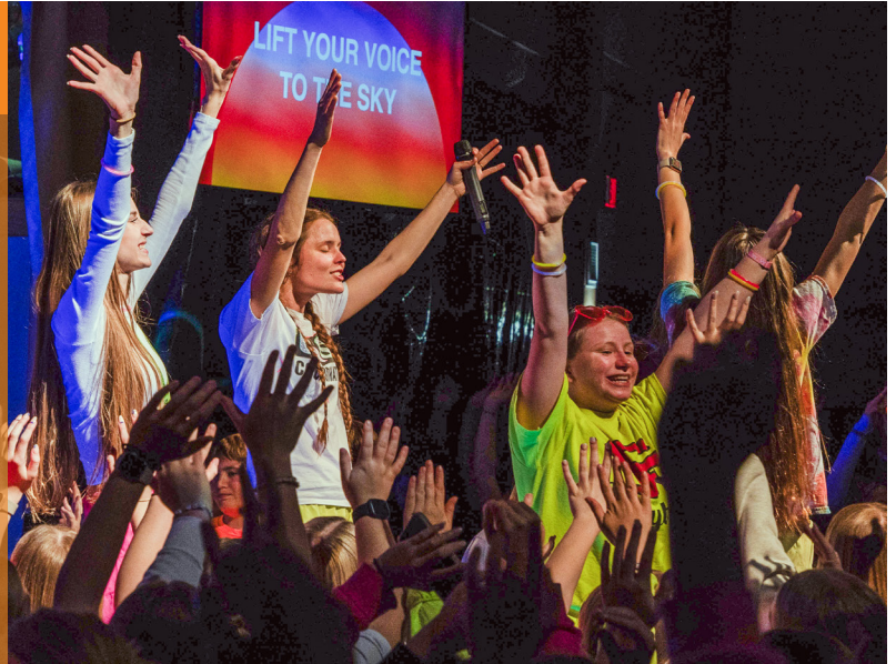
Last Night of CHAOS 2024

Recordings of sermons available on Vimeo.com/mynazareth Livestreams Broadcast on our website www.naz.org/onlinechurch